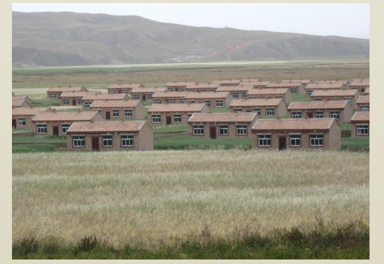
Figure 3: Example of a resettlement area in the Province Gansu

Since a couple of years, China is implementing a large-scale governmental resettlement program is implemented in the nomadic regions. Main idea is to reduce the pressure on degraded pastures by offering opportunities to nomadic households to give up the pastoralism, leave their original regions and move to houses in the vicinity of cities that have been especially built for this purpose. In special contracts with the authorities, it is fixed that the nomadic households abstain from using the pastures for 5-10 years, sell their livestock and get a financial compensation during this time (this can be seen as special payment for an ecosystem service, namely the regeneration of pastures). The authorities also encourage the resettlement households to get accustomed to the life in a city, to find an appropriate job etc.. Theoretically, the resettled households can return and re-use their pastures after the term specified in the contract.