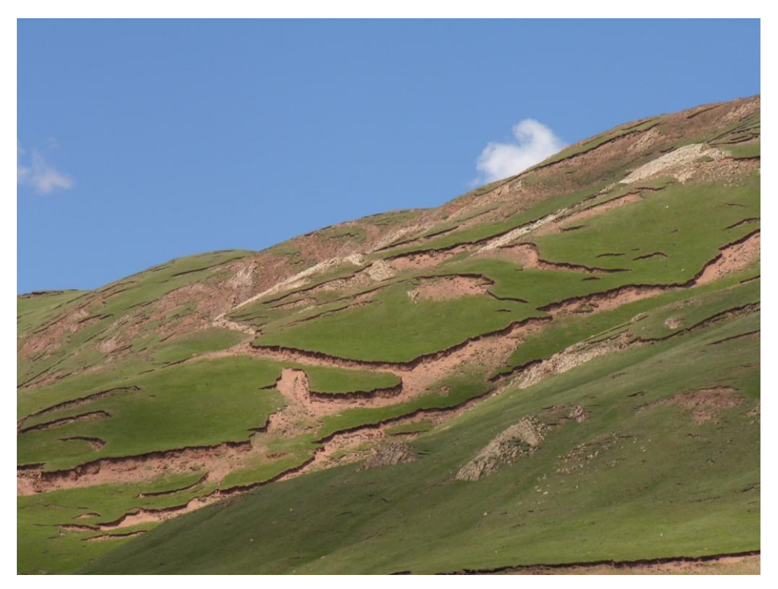
Figure 1: Degraded pastures in Surug (Yushu, Tibetan Highlands)

pasture. Various studies have shown that shortage of rainfall and/or amplification of grazing pressure due to enlarged herd sizes or elongated standing times can reduce vegetation growth and cause degradation of the pasture (cf. Mueller et al. 2007a).